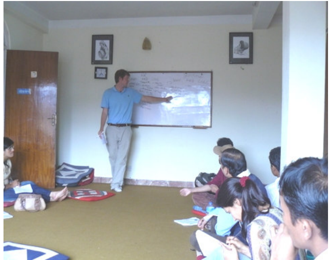
Presentation from an AP intern during the Focal Point meeting, July 27

COCAP and its member organizations must also take action to end slavery. Already in the Far-Western Region organizations like Human Rights and Social Development Center (HURADC) Kailali, have began working to raise awareness about this terrible practice. HURADC also is helping Kamaiya families sustain themselves without selling their children through income generation projects. If we as a society can all take responsibility and support and initiate more programs like these than certainly we can end the Kamalhari system and help the Kamaiya people raise their standard of living.