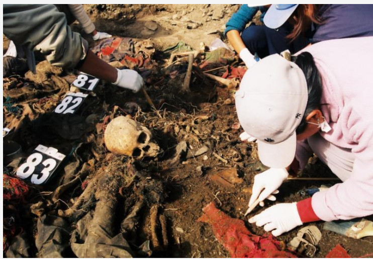
Victims of a dirty war: EPAF exhumed 92 bodies at Putis

The UN group pointed out that the number of disappearances still remains in dispute, twelve years after the much-praised report of the Truth and Reconciliation Commission. The official registry lists 8,661 names, but EPAF alone has collected 13,271.