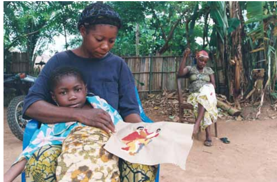
Sewing the panels was a group effort for women at the SOSFED center in Mboko.