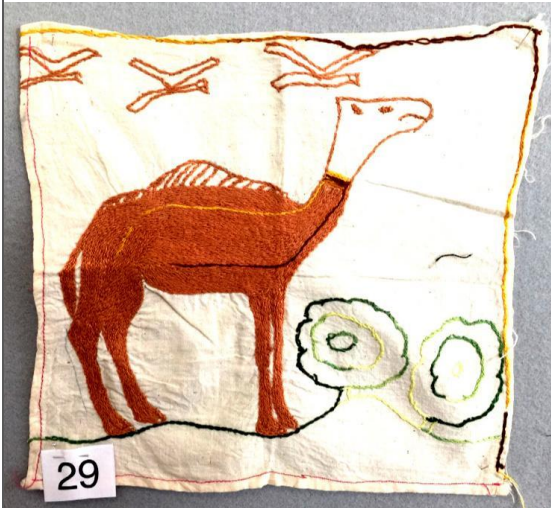
Before: Colleen worked with this embroidered block from Mali