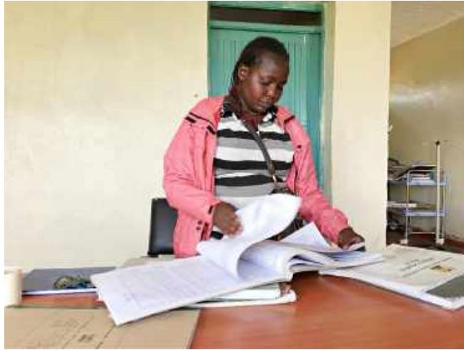
Above: maternal clinic in Longewan; right: Head Teacher and Deputy Head Teacher at Baragoi Mixed Primary School